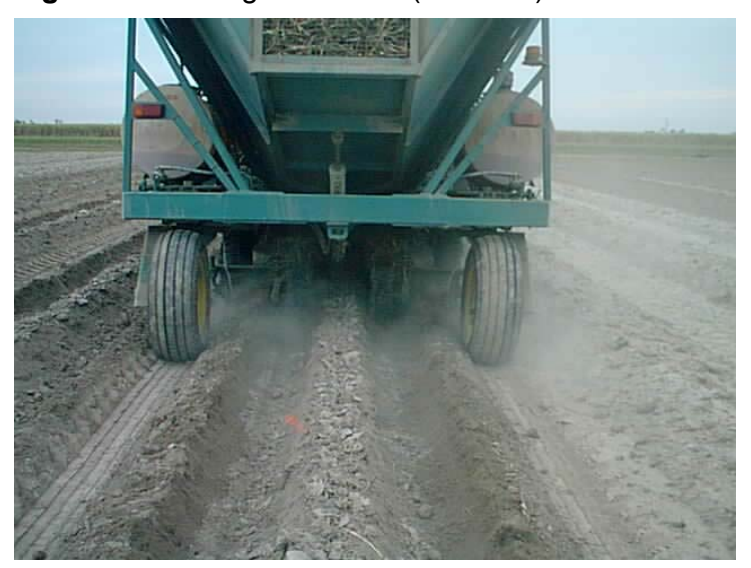
Figure 1: Planting of site two (dual row).

Reefsafe®/Agrispon® was applied to the plant billets as they were dropping through the planting chute. The Reefsafe®/Agrispon® rate of 1L/ha was determined by the width of the planter shoot furrow.